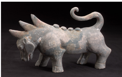
China, 3rd or 4th century. Figure of a mythical tricorn animal (85.039).

DRY! Once you've created a finished sculpture, it's time to let it dry. Drying time varies, but could take two to three days in the sun. With an adult's help, you can also dry your sculpture in an oven at 200 degrees. Paper clay is paintable, too! Store unused clay in the refrigerator for up to two days.